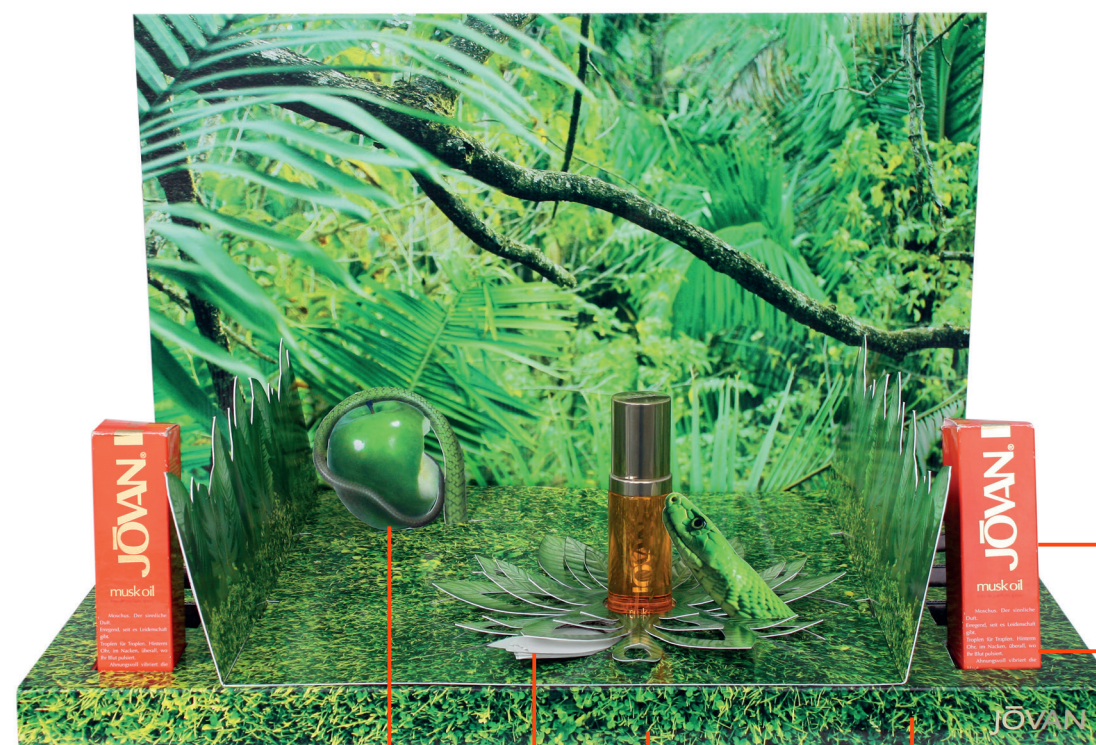
Counter Display made out of 100% cardboard

The JOVAN perfume represents the feeling of freedom, seduction and irreverence. Adam and Eve were seduced by the snake with an apple. But here the snake literally turns it's back on the apple and chooses the perfume as a means of seduction. In this regard every customer will be seduced by the JOVAN perfume.