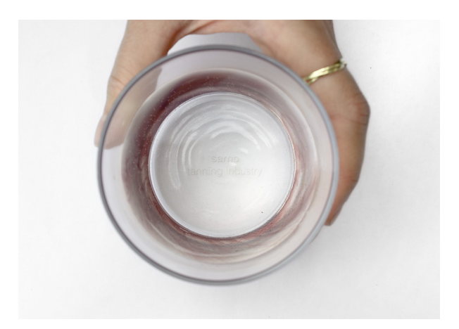
An embossing in the bottom of the glass contains brief information about which river the glass is and what it is contaminated with