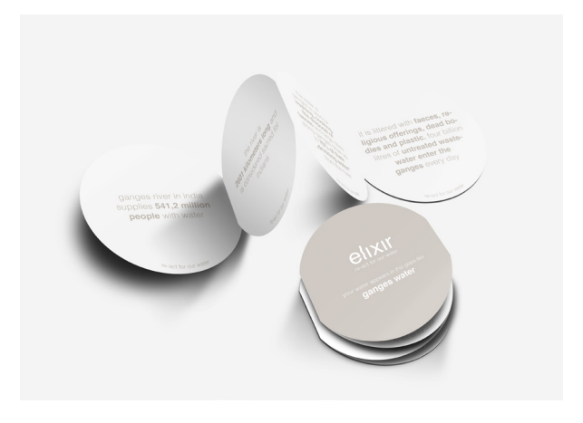
A brochure in the glass bottom provides detailed information about the reasons for water pollution

Sarno River in Europe is polluted with sewage from the italian tanning leather industry and agricultural waste.