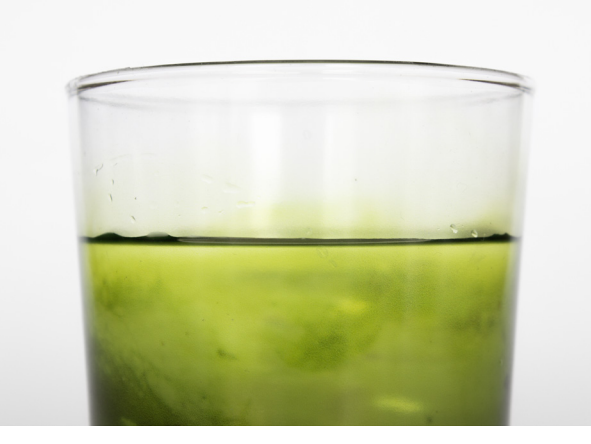
The design works for any water level